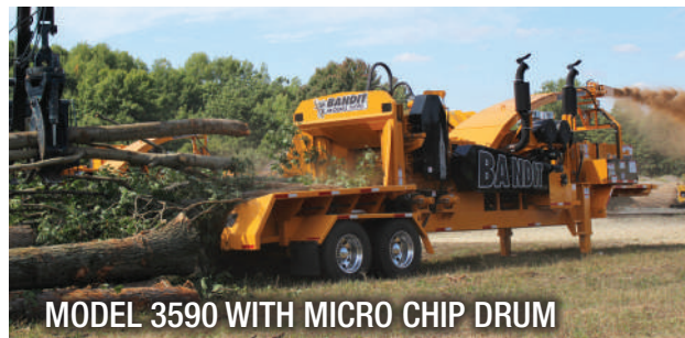
MODEL 3590 WITH MICRO CHIP DRUM

Bandit whole tree chippers are built incredibly strong, utilizing extensive welded assembly with large disc/drum shafts and thoroughly reinforced chipping drums. That's why every new Bandit whole tree chipper is backed by a five-year GUTS warranty that covers the Bandit-fabricated disc/drum assembly and the Slide Box Feed System. Contact Bandit for warranty details.