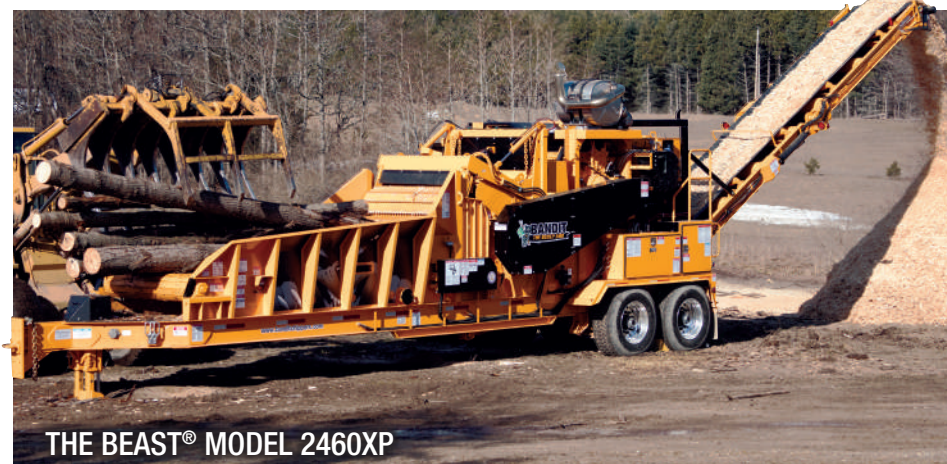
THE BEAST® MODEL 2460XP

The 2460XP will out perform all other grinders in its size class. The 2460XP is equipped with a 60" wide by 30" diameter cuttermill, a 60" wide by 24" mill opening. This machine uses a 30-tooth cuttermill running Bandit's patented saw-tooth style cutterbodies that regulate the size of the tooth's bite. Most of the material is sized in the initial cut, so material exits the large screening area quicker.