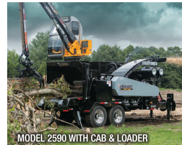
MODEL 2590 WITH CAB & LOADER