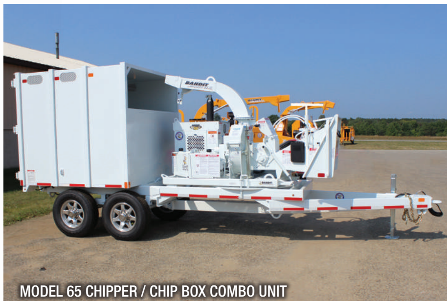
MODEL 65 CHIPPER / CHIP BOX COMBO UNIT

PTO-powered chippers are ideal for orchards, farms or estates where tractors or other PTO-capable vehicles are already in-use for grounds maintenance. PTO chippers are available as towable or tractor-mount with a three-point hitch. New 9" and 12" PTO chipper options are driven via PTO shaft from a chip truck, and are available with either a rear or curb-side feed.