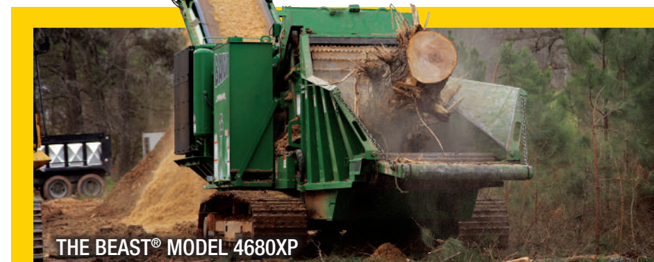
THE BEAST® MODEL 4680XP

turn The Beast into a high-production chipper. Available as an 8-knife or 20-knife drum, this option effectively turns The Beast into a large, screened chipper capable of producing chips from ¼" to 2" in length.