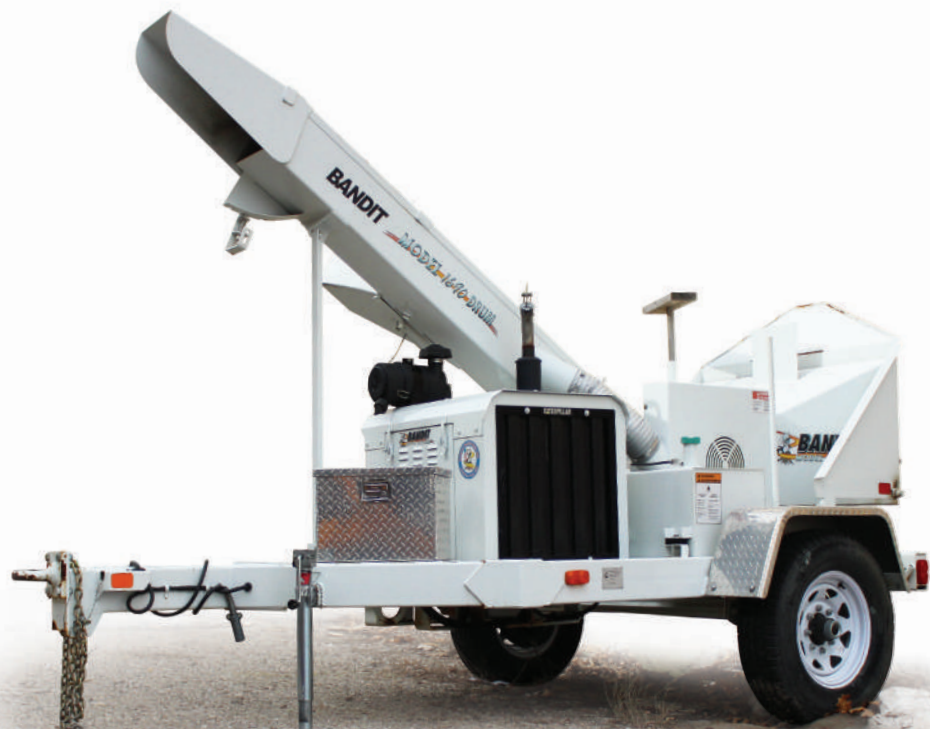
MODEL 1690 CONVENTIONAL DRUM CHIPPER

Still popular with utility line crews and maintenance companies with large fleets, this low-maintenance chipper forgoes a feed system. Material is pulled in directly by the 16" diameter four-knife chipping drum and features a 10" by 16" throat opening. Chips exit through a stationary discharge, with an auxiliary side discharge optional.