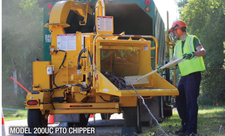
MODEL 200UC PTO CHIPPER