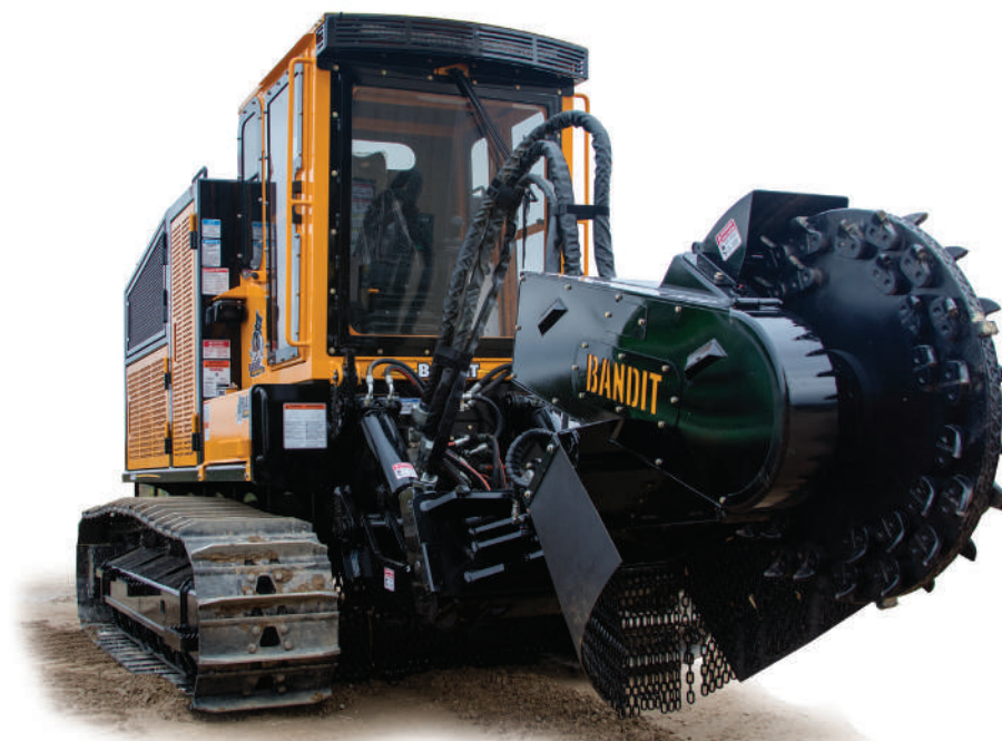
BTC-300 WITH STUMP GRINDER ATTACHMENT

The BTC-300 is a completely new track carrier from Bandit Industries. From its redesigned deluxe operator's cab with its outstanding visibility, lower ground pressure, and numerous mechanical updates and Tier 4 engine power, the BTC-300 delivers exceptional land clearing performance with exceptional reliability and class-leading levels of comfort. Built from extensive customer feedback and over a decade of experience with track carriers in high-production land clearing environments, the BTC-300 further builds on Bandit's vision for a high-performance, all-terrain mowing and stump grinding machine.