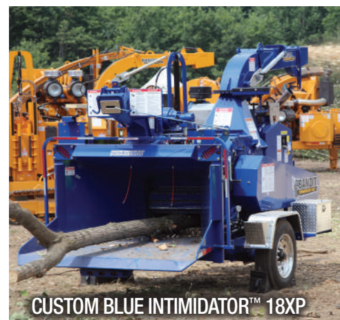
CUSTOM BLUE INTIMIDATOR™ 18XP