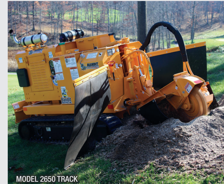
MODEL 2650 TRACK

Available with a 122-HP Tier 4 diesel, 165-HP gas V8 power and belt drive, the Model 3100 is high-production, cost-effective stump grinding powerhouse.