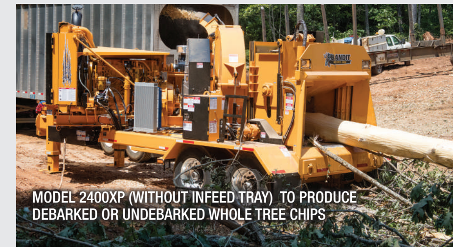
MODEL 2400XP (WITHOUT INFEED TRAY) TO PRODUCE DEBARKED OR UNDEBARKED WHOLE TREE CHIPS

Because Bandit machines are built by specialized teams and not on an assembly line, incorporating custom designs to fit unique needs is not a problem! Contact Bandit to learn more about customized equipment.