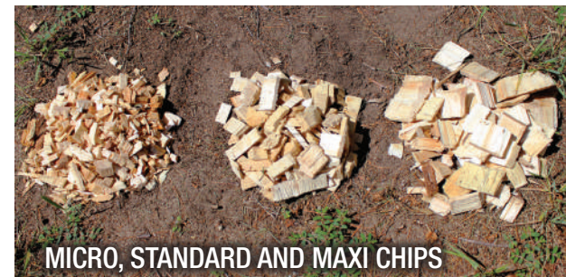
MICRO, STANDARD AND MAXI CHIPS