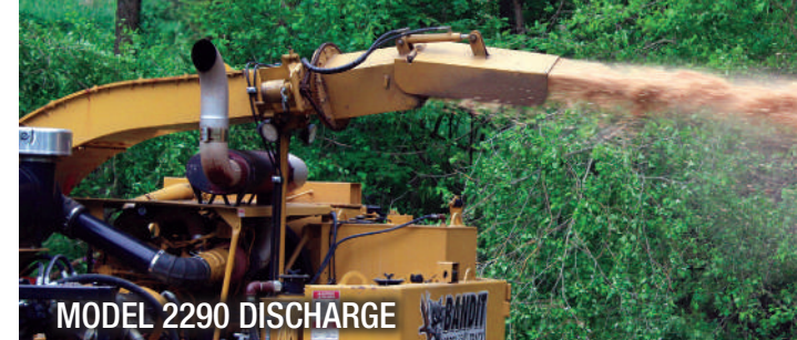
MODEL 2290 DISCHARGE