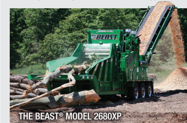
THE BEAST® MODEL 2680XP

More than 30 enhancements to The Beast line in 2015 have increased production by as much as 50% in most applications.