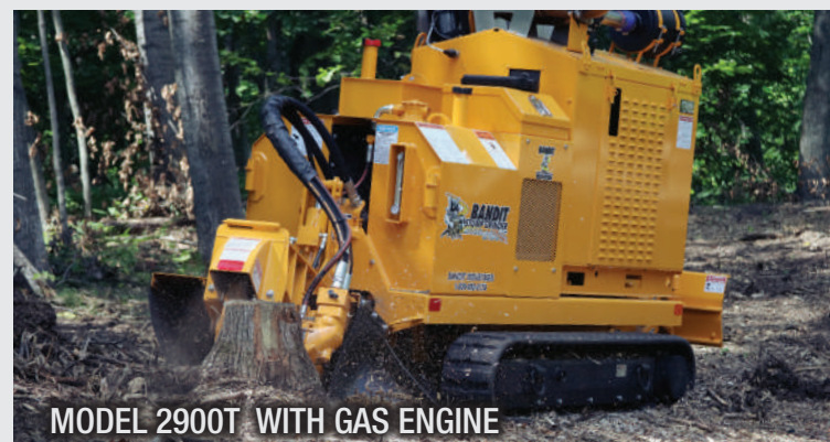
MODEL 2900T WITH GAS ENGINE

Convenience items such as wireless remote control and grading blades are available on most Bandit stump grinders. Gasoline or diesel engines are also available, ranging from 25- to 165-horsepower.