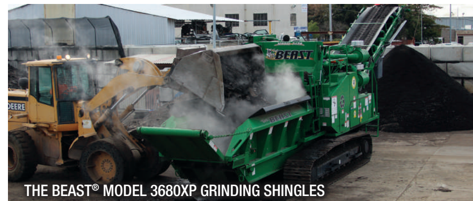
THE BEAST® MODEL 3680XP GRINDING SHINGLES