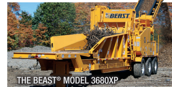
THE BEAST® MODEL 3680XP

With numerous tooth and screen options to choose from, The Beast can easily serve a variety of markets. Produce high-quality mulch from waste wood, then switch to knives to produce screened wood chips. Equipped with the shingle grinding package, The Beast can recycle shingles for hot-mix asphalt supplement. Install an optional colorizer and produce colored landscape mulch.