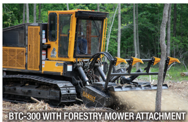
BTC-300 WITH FORESTRY MOWER ATTACHMENT

Whether clearing acres of trees or fields of stumps, the BTC-300 can handle it with newly designed mowing and stump grinding attachments. The forestry mower features a very wide 90-inch cut and can easily take down small-to-medium sized trees. A new float feature helps the mower head ride at ground level without digging in. A patent-pending tooth and holder design aggressively processes trees, limbs and brush, mulching it all directly into the ground. The stump grinding head features a 44-inch diameter grinding wheel with a deeper reach, and it offers 30% more torque than previous models for quick efficient grinding. Switching between the attachments is extremely easy, taking less than 10 minutes in the field.