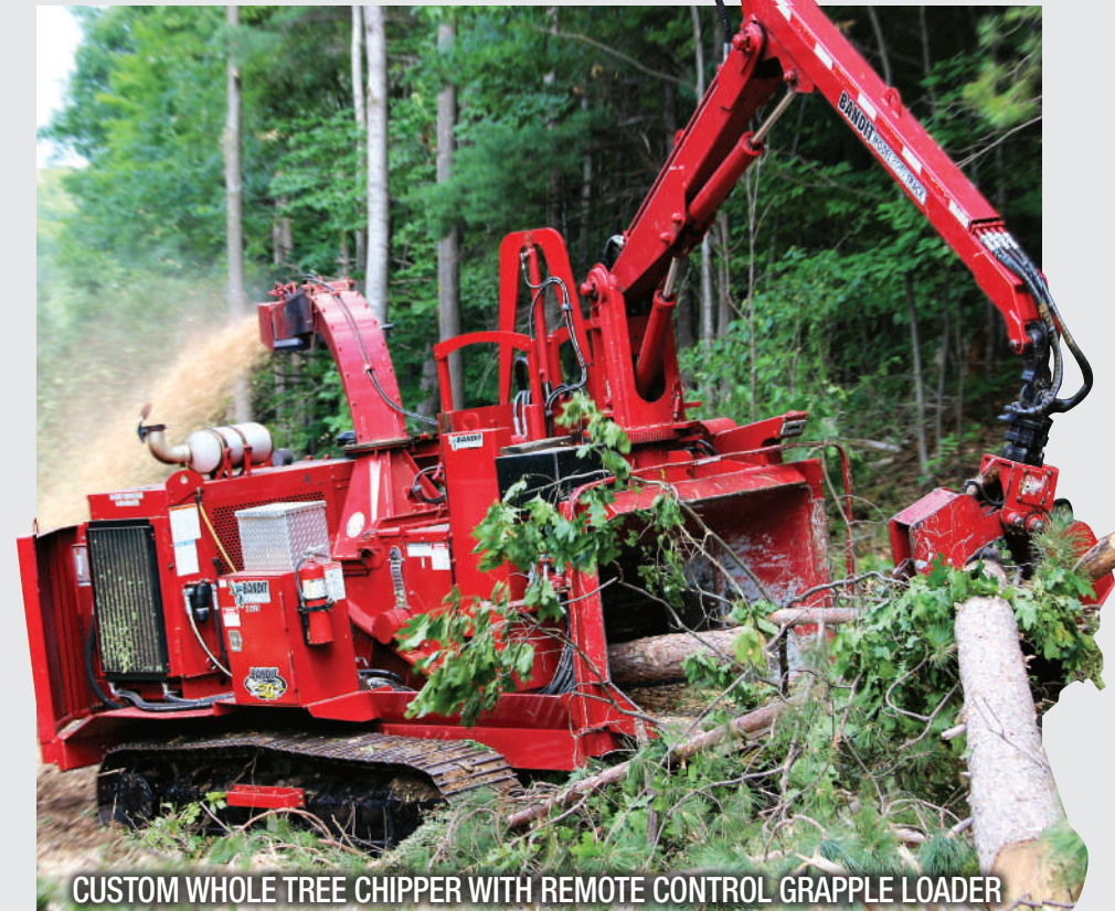
CUSTOM WHOLE TREE CHIPPER WITH REMOTE CONTROL GRAPPLE LOADER

Model 490XP 4" Capacity 18 HP and PTO option