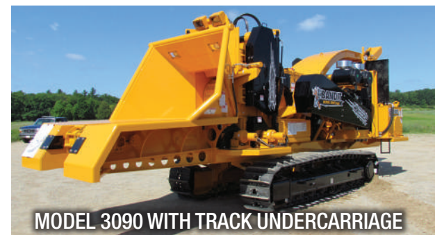
MODEL 3090 WITH TRACK UNDERCARRIAGE

Bandit introduced the industry's first self-propelled track whole tree chipper in 1991. Today, industry-proven CAT® steel-track undercarriages are available on every Bandit whole tree chipper, giving these machines all-terrain capability to serve a range of specialty clearing applications such as power line maintenance, oil/gas exploration or new road construction. Self-propelled units are also great for logging operations, making it easier to position the chipper on the landing. Operated via wireless remote, a single operator in a loader can control all chipper functions.