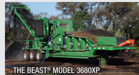
THE BEAST® MODEL 3680XP