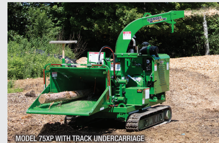
MODEL 75XP WITH TRACK UNDERCARRIAGE

Expect significantly less maintenance and downtime with a Bandit hand-fed chipper. Heavy-duty materials and components with solid welded construction help these machines withstand the daily rigors of chipping. It's not uncommon for a Bandit hand-fed chipper to be on front-line duty for more than 10 years and 10,000 hours.