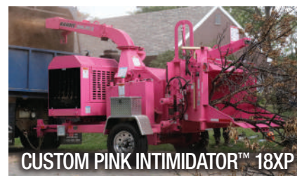
CUSTOM PINK INTIMIDATOR™ 18XP