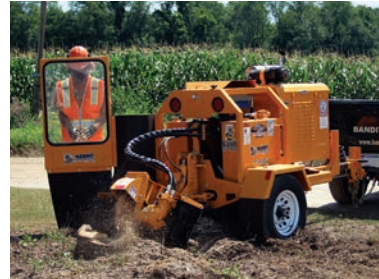
MODEL 2600 TOWABLE