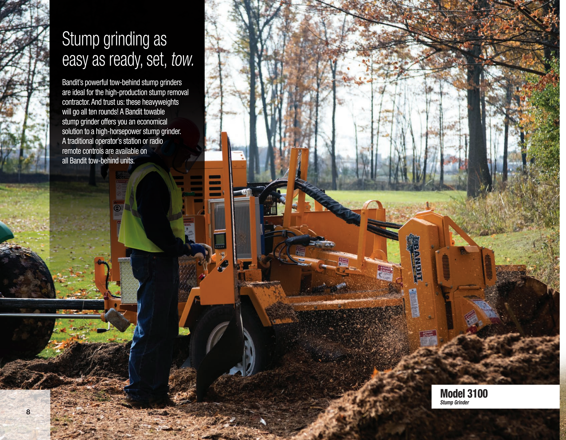
Model 3100 Stump Grinder

Bandit's powerful tow-behind stump grinders are ideal for the high-production stump removal contractor. And trust us: these heavyweights will go all ten rounds! A Bandit towable stump grinder offers you an economical solution to a high-horsepower stump grinder. A traditional operator's station or radio remote controls are available on all Bandit tow-behind units.