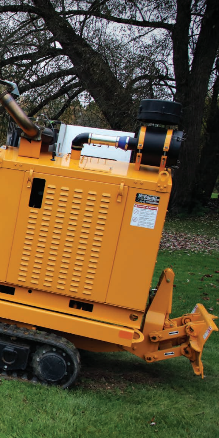
Model 2900T Stump Grinder

The Bandit Backbone includes factory parts support and both parts and service support from over 200 Bandit authorized dealers worldwide. When problems arise, Bandit is committed to getting you back up and running with minimal downtime.