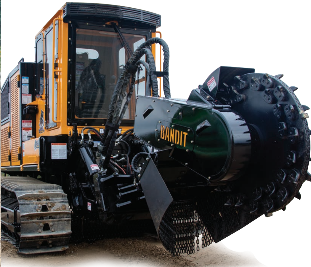
BTC-300 WITH STUMP GRINDER ATTACHMENT

Operators will not want to leave the BTC-300's luxurious, state-of-the-art operator's cab. Ballistics-grade poly-carbonate windows negate the need for window guards, providing superb visibility while still meeting ROPS/ FOPS/OPS certification. Finished interiors with rubber-isolated cab mounts create a surprisingly quiet atmosphere for operators to work, yet still allow the cab to tilt for easy maintenance access. Industry-leading HVAC systems with window and foot vents ensure cool operation in summer and plenty of warmth in winter. Additional convenience items like padded cell phone holders, 12V charging ports and oversized cup holders ensure no other operators are treated as well in any other machine.