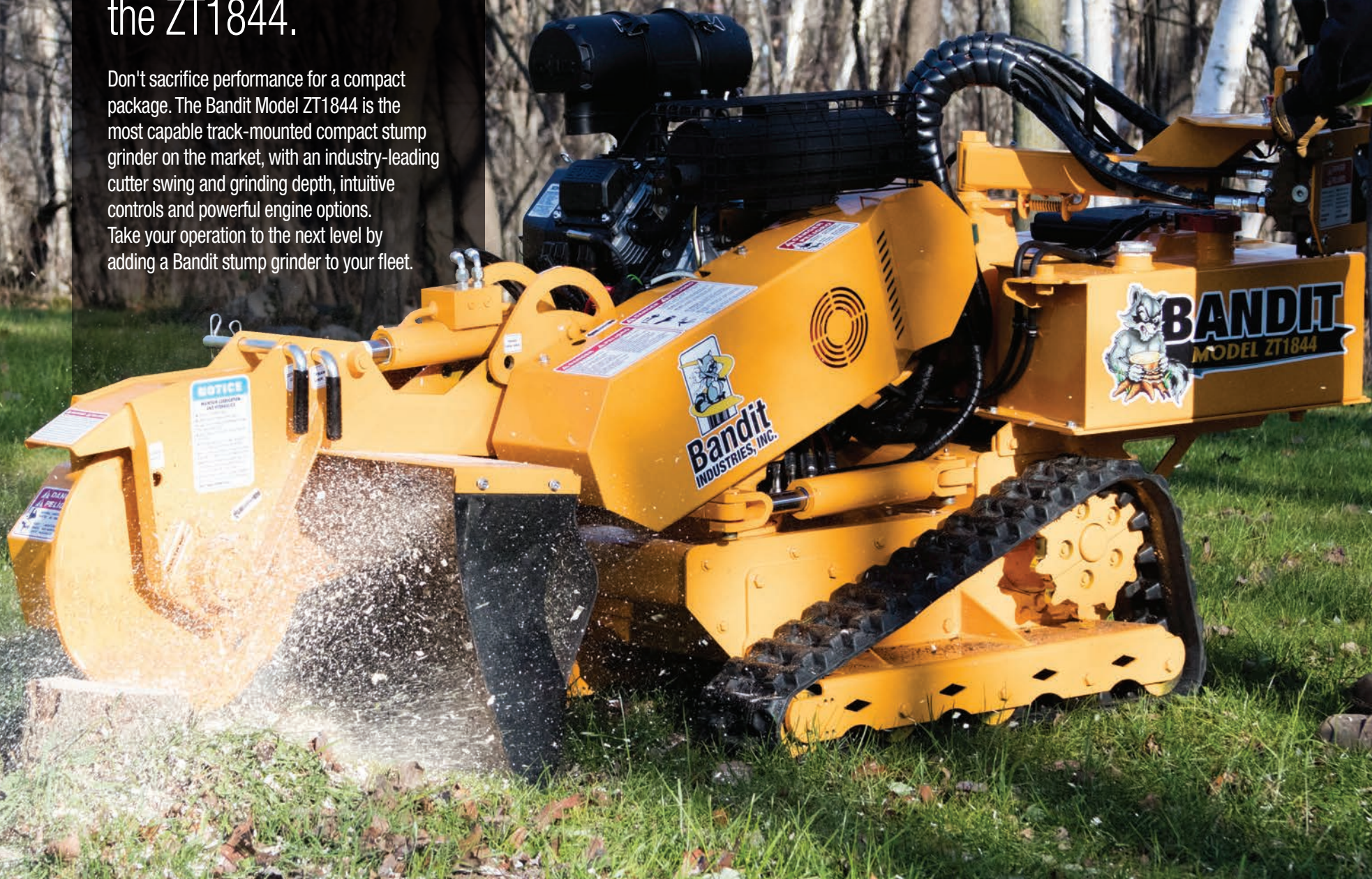
Model ZT1844 Stump Grinder

Don't sacrifice performance for a compact package. The Bandit Model ZT1844 is the most capable track-mounted compact stump grinder on the market, with an industry-leading cutter swing and grinding depth, intuitive controls and powerful engine options. Take your operation to the next level by adding a Bandit stump grinder to your fleet.