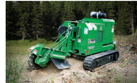
MODEL 2650 TRACK