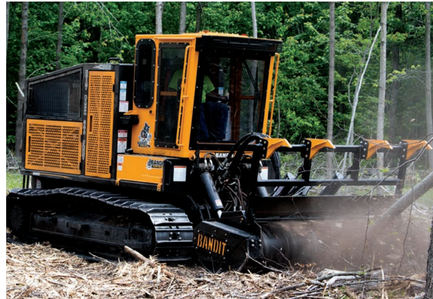
BTC-300 WITH FORESTRY MOWER ATTACHMENT

The BTC-300 is a completely new track carrier from Bandit Industries. From its redesigned deluxe operator's cab with its outstanding visibility, to numerous mechanical updates and Tier 4 engine power, the BTC-300 delivers exceptional land clearing performance with exceptional reliability and class-leading levels of comfort.