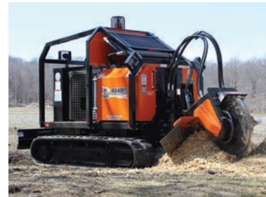
MODEL 3400 TRACK