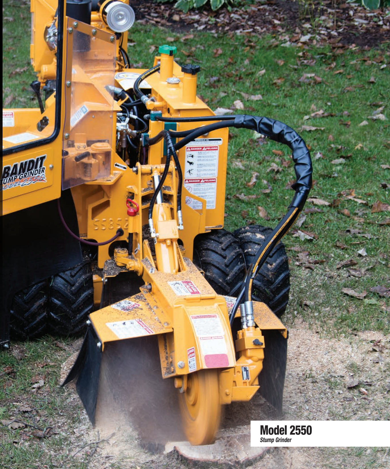
Model 2550 Stump Grinder

Bandit uses the highest-quality steel to create the strongest stump grinding platform. We use aggressive hydraulic systems, heavy-duty pumps, the highest-quality bearings and reliable engines on all of our stump grinders. Power, performance and longevity; it's what you can expect from Bandit.