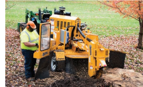
MODEL 3100 TOWABLE