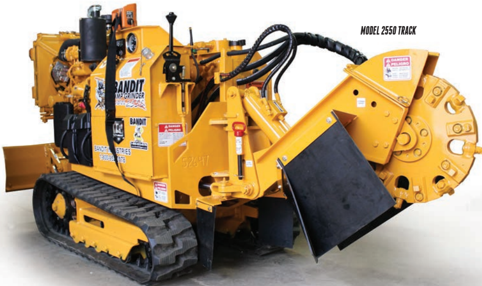
MODEL 2550 TRACK